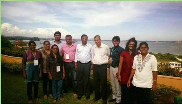
Colombo University who participated in the Research Colloquium

SPARC participated in the ASCENT Research Colloquium and Discussion Forum organized by the Faculty of Agriculture, University of Ruhuna from 27th February to 4th March 2017 at University of Ruhuna and the Fisherman's Bay Hotel, Weligama. The programme covered an array of topics related to disaster management such as; research methods, Disaster Risk Resilience, observation and experimental studies, interviews, Delphi Method, systematic reviews, questionnaire survey and planning and designing and research ethics.